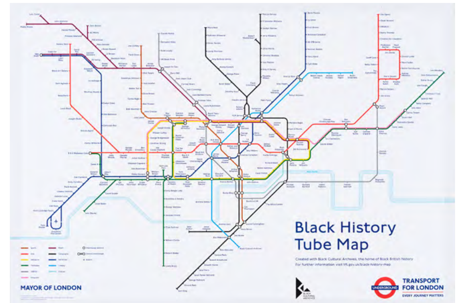
Black History Tube Map. Printed poster, Black Cultural Archives and Transport for London, 2021

By joining the Prints and Drawings Acquisition Group, you will support contemporary artists, extend public engagement, and help build one of the greatest public collections in the world.