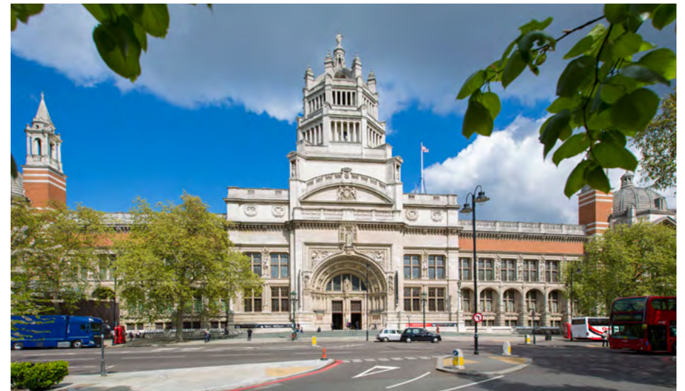
V&A South Kensington , Cromwell Road Entrance

Today, the V&A is a family of museums comprising V&A South Kensington, Young V&A, V&A Dundee, V&A Wedgwood Collection in Stoke-on-Trent, and two new sites in Queen Elizabeth Olympic Park, east London: V&A East Storehouse and V&A East Museum.