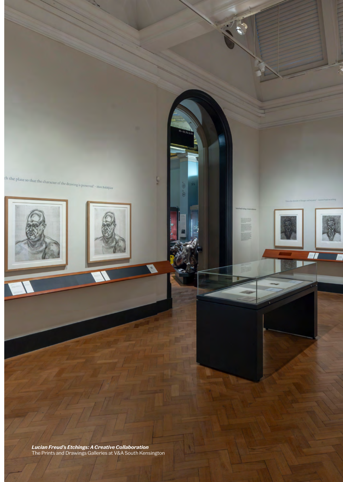
Lucian Freud's Etchings: A Creative Collaboration The Prints and Drawings Galleries at V&A South Kensington

The support of the Prints and Drawings Acquisitions Group is crucial to these gallery spaces, enabling new acquisitions to join the collection and enhance our lively programme of rotating displays.