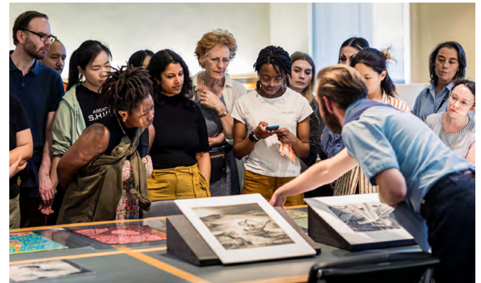
V&A Friday Late, curator talk in the Prints and Drawings Study Room, V&A South Kensington