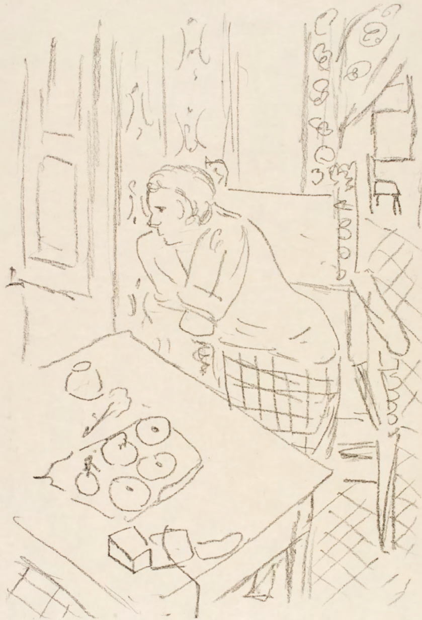
Figure dans un intérieur Lithograph, Henri Matisse, 1925 Given by the National Art-Collections Fund

The Prints and Drawings Acquisition Group builds on the V&A's extraordinary legacy and dedication to collecting artworks on paper, concentrating on expanding our contemporary holdings and filling gaps which exist within the historic collection. It is important for the V&A to continue to engage with and collect prints and drawings, as they are mediums which both established and emerging artists turn to as they allow expression and experimentation on an intimate scale.