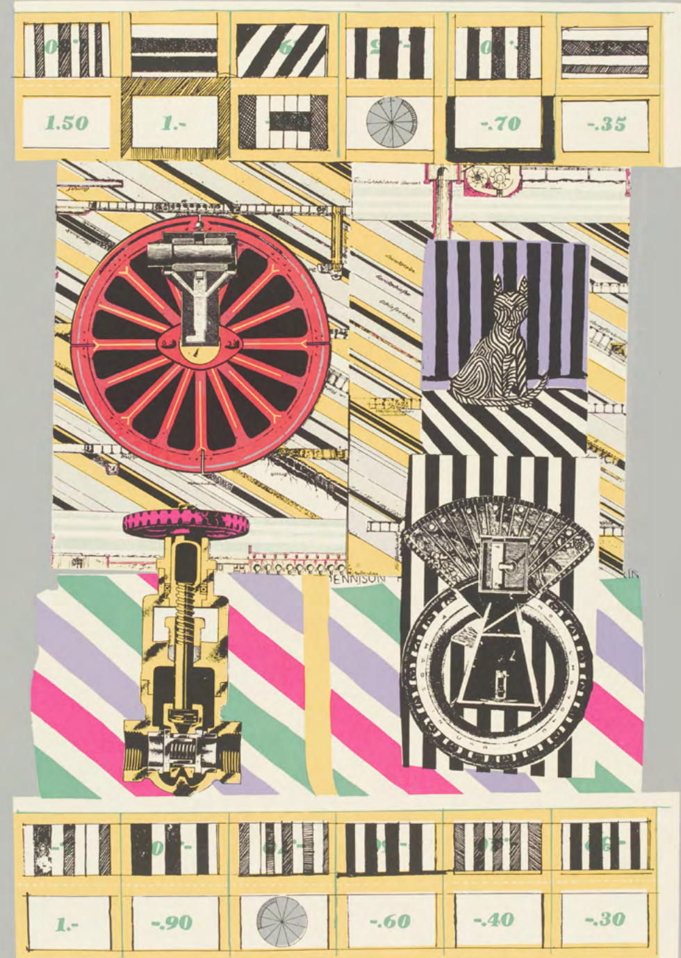
Four Stills From the History of Nothing Screenprint, Eduardo Paolozzi, 1962 Given by the artist

CAF payments, or payments from your charitable trust or foundation can be accepted for your donation.